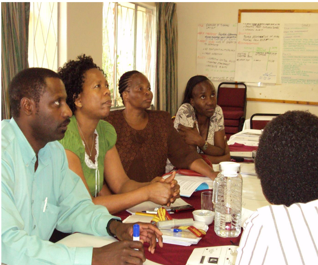
Concentration: leadership students Botswana.